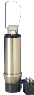
Shown with B Connector

Coil Resistance: 2.79 Ohms, +/-10% Coil Inductance: 180 μH, +/-10% Back EMF Voltage: 108 μV/Degree/Second, +/-10% Current, RMS: 3.9 A, Maximum Current, Peak: 20 A, Maximum Small Angle Step Response: 200 μs, with appropriate CTI Y mirror