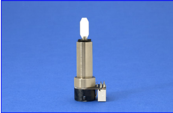
Shown With Mini-CT Connector

Coil Resistance: 3.7 Ohms, +/-10% Coil Inductance: 109 μH, +/-10% Back EMF Voltage: 48.7 μV/(deg/sec) RMS Current: 2.4 A at Tcase of 50°C, Max Peak Current: 8 A, Max Small Angle Step Response: 100μs