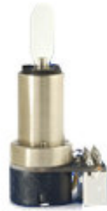
Shown With Mini-CT Connector

Coil Resistance: 2.14 Ohms, +/-10% Coil Inductance: 52 μH, +/-10% Back EMF Voltage: 20.9 μV/degree/sec, +/-10% RMS Current: 2.3 Amperes at Tcase of 50°C, Max Peak Current: 6 Amperes, Max Small Angle Step Response: 130 μs with 3mm Y mirror, settled to 99%